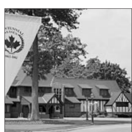
The majestic clubhouse at Essex Golf & Country Club nestles amongst the trees.